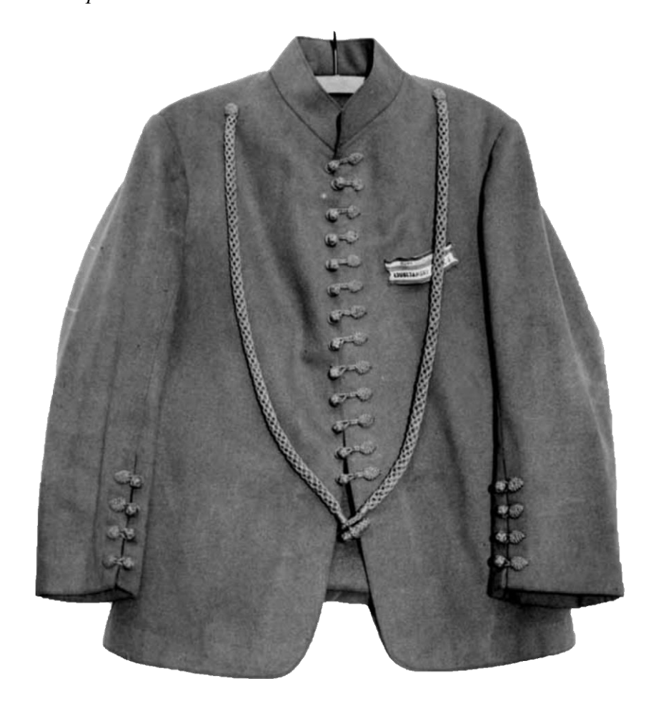
Figure 11. Uniform of a memebr of the Ljubljana Sokol »surka«.

In January 1911, the SSU recommended that clubs and individuals order belts with the Sokol monogram from the Anton Škof Company in Ljubljana. According to the union, these monograms were not only cheaper but also more attractive than the previous ones. The price of a belt with monogram was 2 crowns, 30 hellers. The union confirmed the Jesih & Windischer company as the supplier of