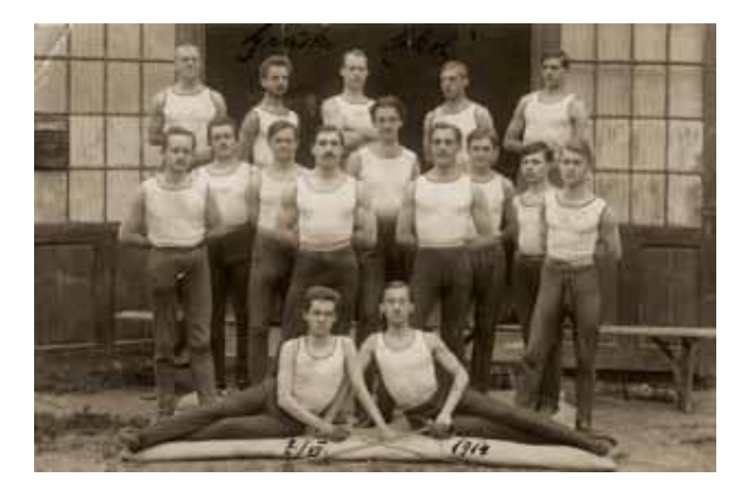
Figure 9. Portrait of Graz Sokol Club in 1914.