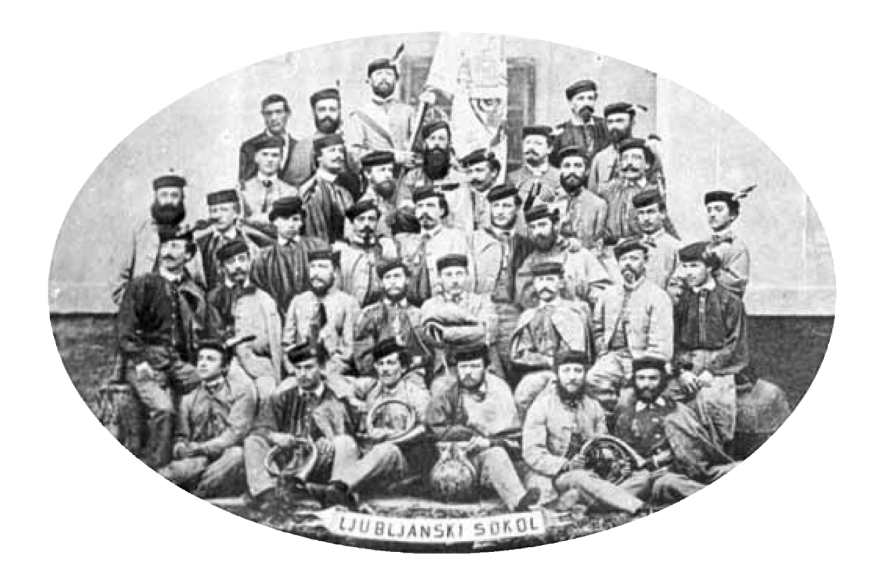
Figure 2. Ljubljanski Sokol members, 1867.