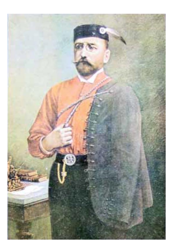
Figure 5. Ljubljana Sokol President Ivan Hribar in 1894.