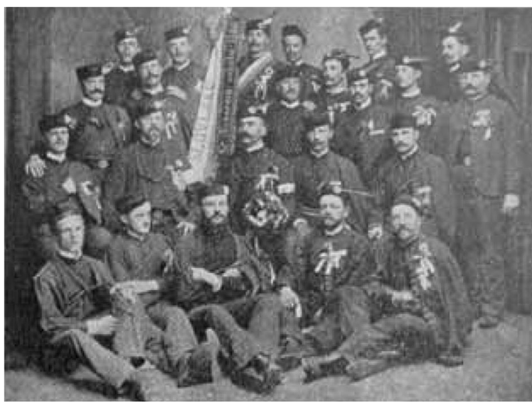
Figure 7. Slovenia Sokol delegation in Prague in 1901.