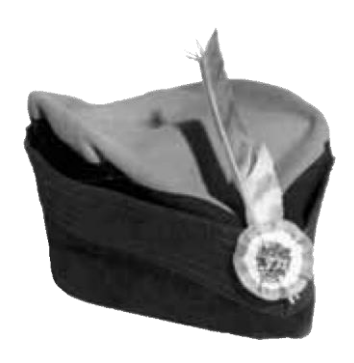
Figure 10. Sokol cap »čikoš«.