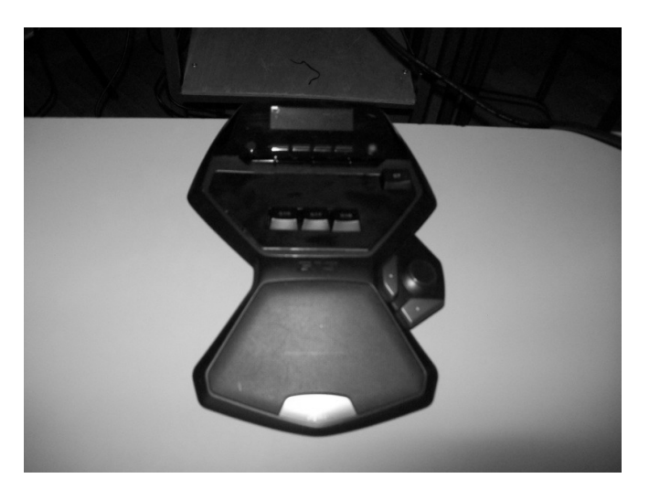
Figure 1. A special keyboard for the entry of deductions (4 keys only, for deductions of 0,1; 0,3; 0,5 and 1 points, respectively).

The RTJS was used to serve as an application for entry of judges' deductions, their recording and display. It was developed in Australian Institute of Sport (Warwick Forbes, Colin Mackintosh) and with collaboration of Faculty of Sport, University of Ljubljana (Ivan Čuk) . It enables the entry of judge deductions in real time during the routine execution. It is composed of a special keyboard with 4 keys (Figure 1), a computer, USB manifold, video camera, manifold of video signal, symbol generator, TV, video-recorder and video-player. System is regulated by a special software developed specifically for this application by Colin Mackintosh (Figure 2).